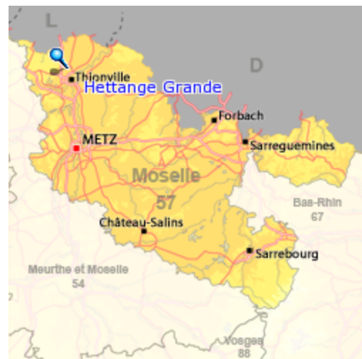
Plan de la Ville de Hettange-Grande/Sœttrich